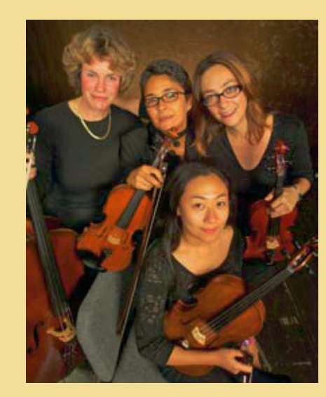
Syracuse Symphony Orchestra String Quartet